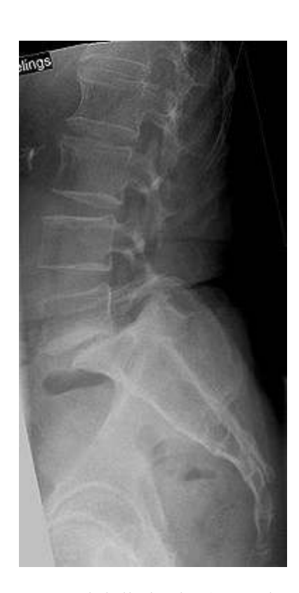
Figure 2. Spondylolisthesis. (Note the misalignment of the fifth lumbar vertebrae above the sacrum, which is the result of slipping forward of the fifth lumbar vertebrae).

In the study on olympic-level female gymnasts spondylolysis and spondylolisthesis were found in 3 out of 19 gymnasts, and were present only in the subgroup with the current ongoing low back pain (Bennet et al., 2006). Similarly to the above mentioned results of Goldstein et al. (1991), the abnormalities of the spine in the study of Bennet et al. (2006) were detected in approximately two thirds of olympic-level gymnasts. In the contrast to this two reports, in the study on elite horse vaulters only slight degenerative changes of the lumbar spine were found with MRI scanning, although 85% of included vaulters reported back pain and 75% reported daily back pain (Kraft et al., 2007). Therefore it may be concluded from this opposite findings that the presence of back pain