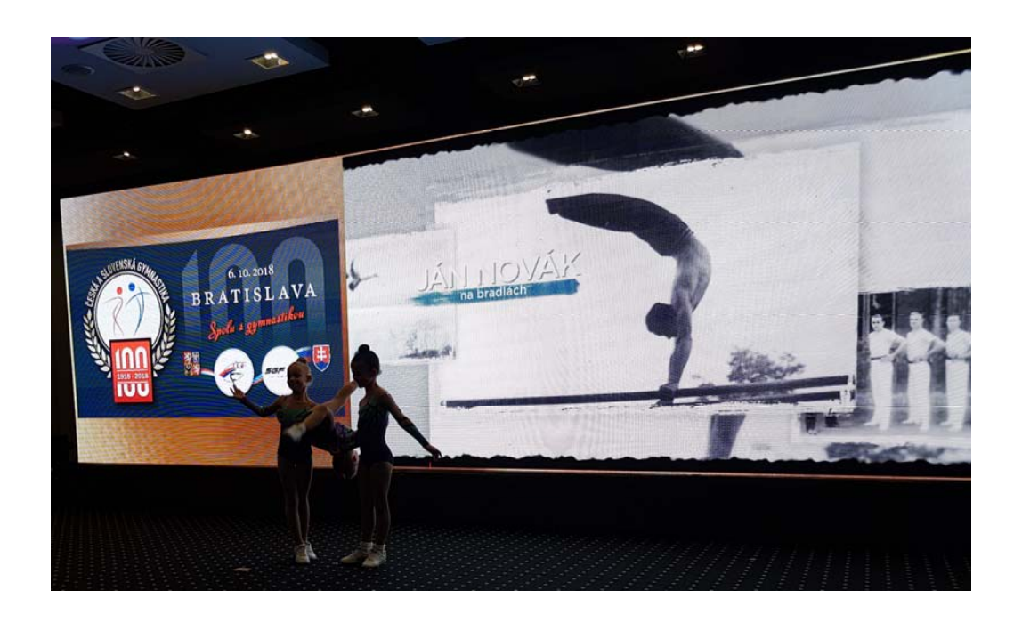
Young talents performing their routines