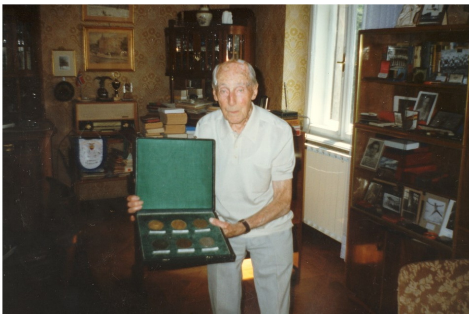
Leon Štukelj and his OG medals at his home in Maribor